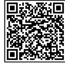
Alle Lernmaterialien zu diesem Thema

Lösungen: Good morning! I would like to make a reservation for a plane ticket to Chicago for tomorrow afternoon. / Certainly. I will need your name, date of birth and address. / My name is David Brown. / Could you spell that for me please? / D as in Delta, A as in Alpha, V as in Victor, I as in India, D as in Delta, space, B as in Bravo, R as in Romeo, O as in Oscar, W as in Whiskey, N as in November. / And what is your date of birth? / It's the 25th of August 1985. / Thank you. And your current address? / 320 Market Street New York, 10445. / So your date of birth is the 25th of August 1985, you live at 320 Market Street New York, 10445 and your name is David Brown, correct? / Correct! What times do you have available? / I have one flight at 9 am and another at 4 pm. / I will take the one at 4 pm. Thank you! / You're welcome. Have a nice trip.